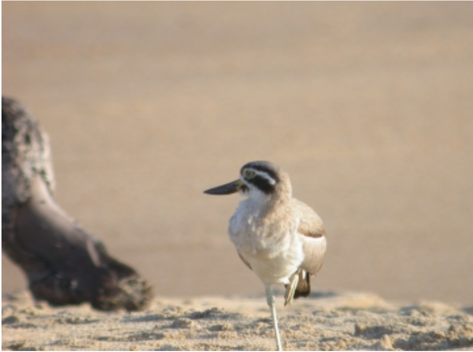
Great Thick-knee